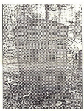
Civil War Tombstone

here were 21 Westonites who fought and died during the Civil War. Ultimately the war ended slavery and preserved the Union.