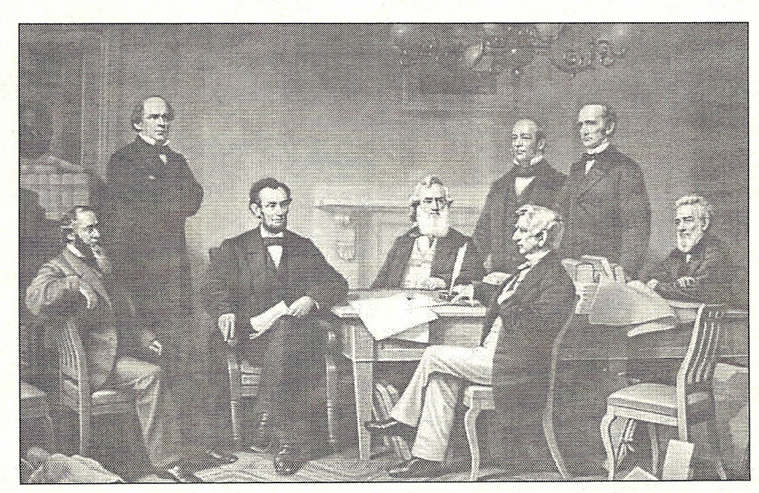
Abraham Lincoln reading the Emancipation Proclamation

difficult to fully document which homes and buildings were used in the Underground Railroad it's believed there was a stop on Ladder Hill Road.